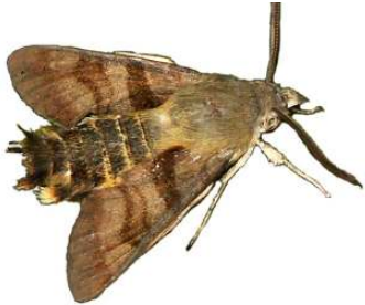
Macroglossum trochilus (Hübner, 1823) Malolotja and Mlawula Checklists ( Macroglossum trochilus trochilus )