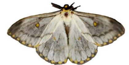
Tagoropsis flavinata (Walker, 1865)