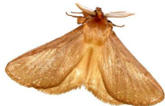
Striphnopteryx edulis (Boisduval, 1847) Malolotja and Mlawula Checklists