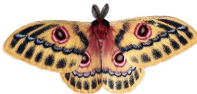
Cinabra hyperbius (Westwood, 1881) R Oberprieler (Cinabra hyperbius hyperbius)