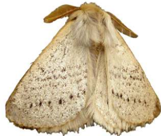
Phyllalia patens (Boisduval, 1847) Malolotja and Mlawula Checklists