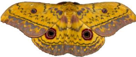
Bunaea alcinoe (Stoll, 1780) Malolotja and Mlawula Checklists