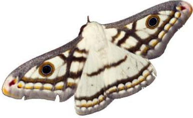
Lobobunaea angasana (Westwood, 1849) Malolotja and Mlawula Checklists