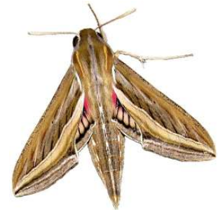
Hippotion osiris (Dalman, 1823)