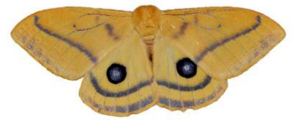
Cirina forda (Westwood, 1849) (Cirina forda forda)