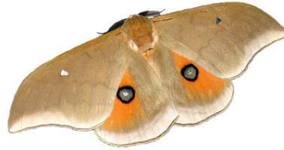
Pseudobunaea tyrrhena tyrrhena (Westwood, 1849) R Oberprieler ( Pseudobunaea tyrrhena )