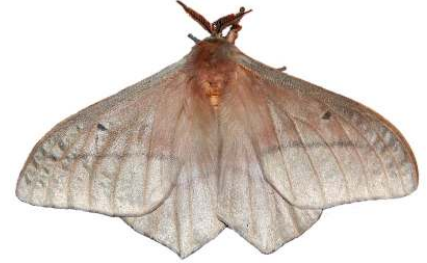
Gonimbrasia zambesina (Walker, 1865) UCT-ADU LepiMAP (Imbrasia zambesina)