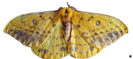
Urota sinope (Westwood, 1849) UCT-ADU LepiMap Swaziland Species List Nov 2016 • UCT-ADU LepiMAP; Lubombo Mountains, Mabuda Farm; 03/01/2017; de Beer Len ;