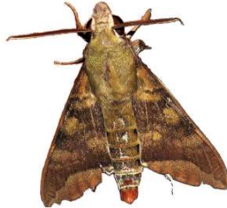
Odontosida pusilla (Felder, 1874) Malolotja and Mlawula Checklists ( Odontosida pusillus ) • UCT-ADU LepiMAP; Pine Valley; 17/10/2015; Kate Braun; LepiMAP 579904 • UCT-ADU LepiMAP; Pine Valley; 09/11/2017; Kate Braun; LepiMAP 634490