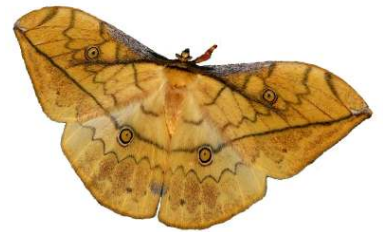
Pseudaphelia apollinaris (Boisduval, 1847)