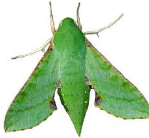
Basiotia schenki (Möschler, 1872)