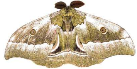
Gyanisa maja (Klug, 1836) Malolotja and Mlawula Checklists