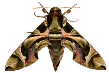
Euchloron megaera (Linnaeus, 1758)