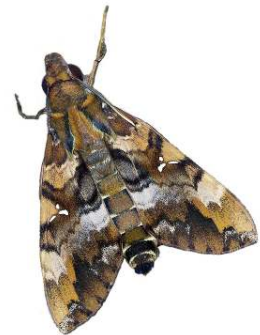
Nephela accentifera (Palisot de Beauvois, 1805) Malolotja and Mlawula Checklists