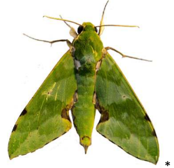
Hippotion celerio (Linnaeus, 1758)