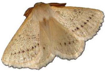
Phiala dasypoda Wallengren, 1860 Malolotja and Mlawula Checklists