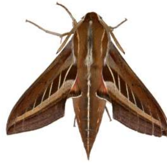
Cephonodes hylas virescens