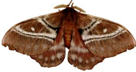
Usta terpsichore (Maassen & Weyding, 1885)